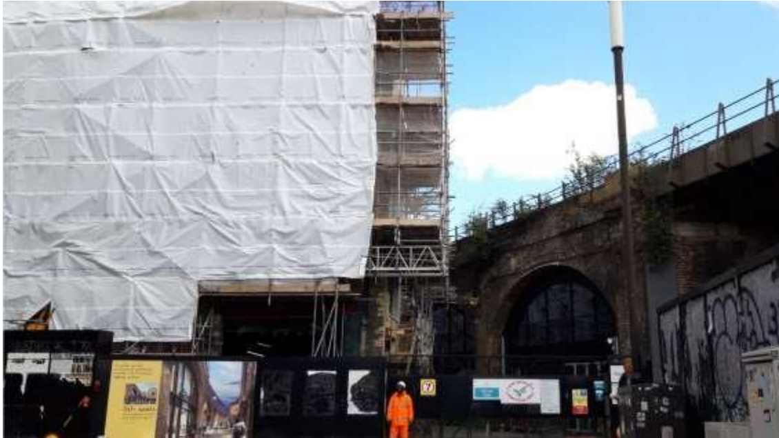
Existing building – the south-western Park Street frontage showing the new building (with retained façade) under construction on the left and arch units on the right.