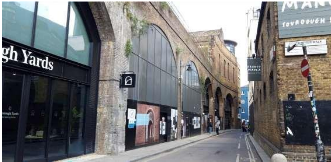
Existing building – view looking north along Stoney Street, with site’s arches on the left-hand side.

Existing site layout plan, under construction