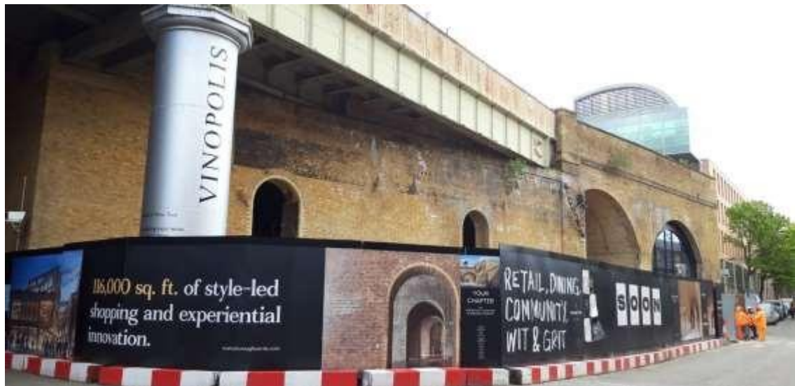
Existing building – view from Bank End of the north-western part of the site.